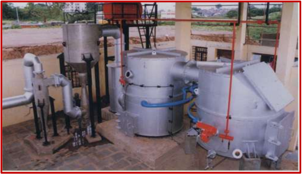
Fig. 7 Flue Gas Treatment at ((Water Grace Products), Nashik