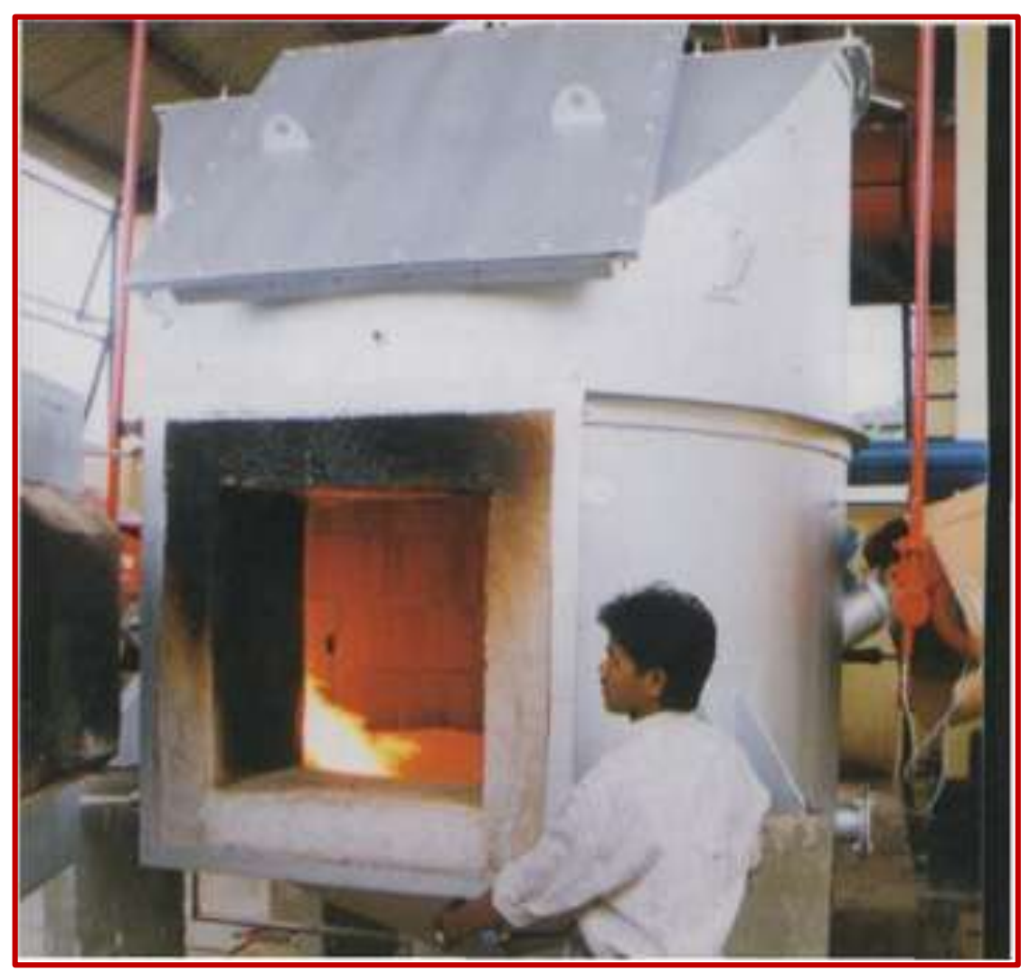
Fig.6 Common incineration facility at ((Water Grace Products), Nashik

Thus bio-medical waste disposal plant i.e. water grace product's is try to fulfilling all the terms and conditions as per the rules but, most of the medical practitioners are disagreed with this facility because they wish to start their own project with the cooperation of Indian Medical Association (IMA) which is rejected because of some difficulties. Further the cost of treatment and disposal of Bio-medical waste is high which are not affordable for smaller health care establishments. Most of the health care practioner recommends that,the cost should be according to waste volume and not according to bed strength.