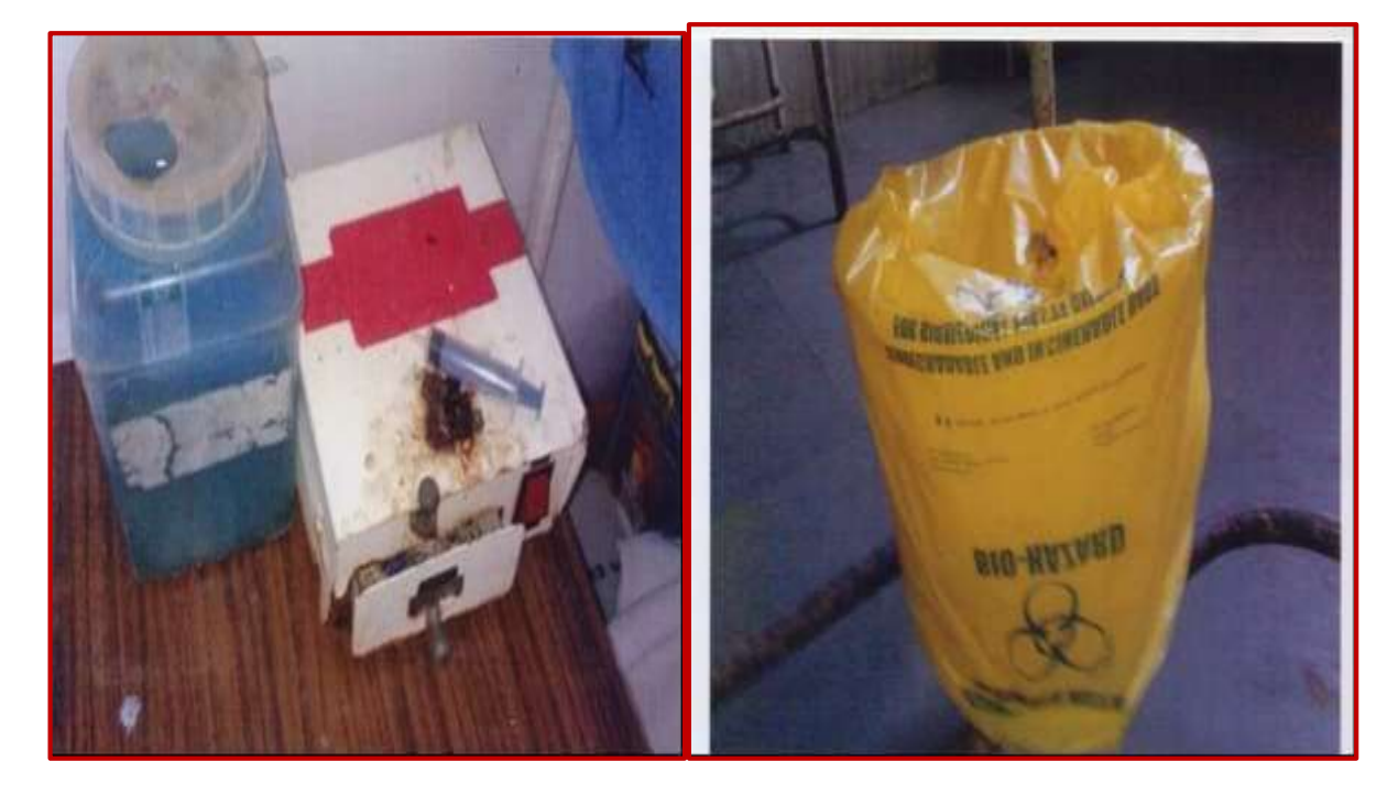
Fig.1 Needle Destroyer Used in hospitals