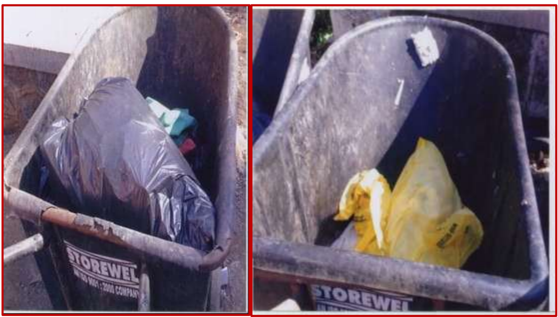
Fig.3 Open dumping of colour coded bags in Civil Hospital