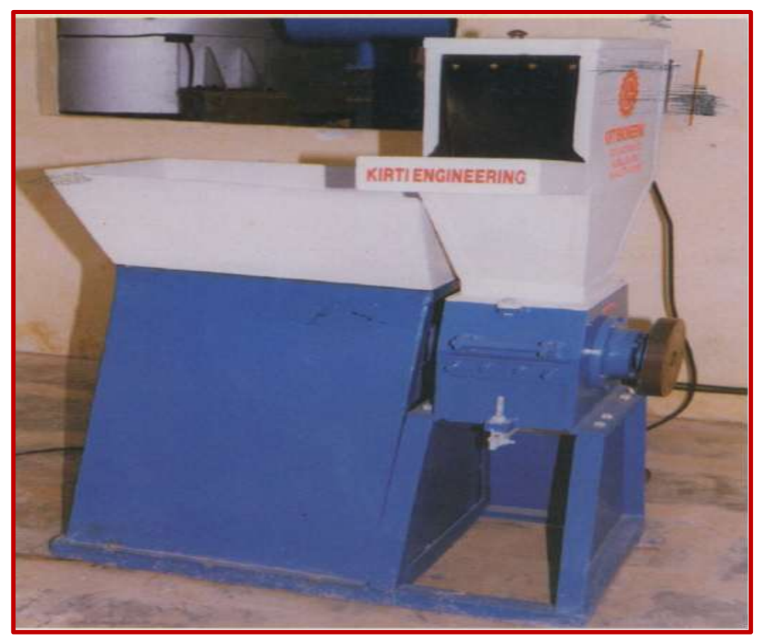
Fig. 8 Shredder at ((Water Grace Products), Nashik