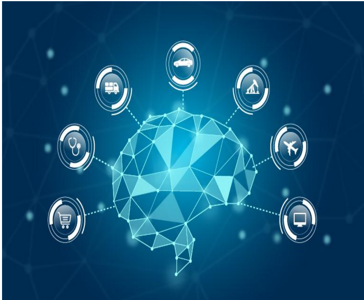
Figure 1: AI-powered IoT.

integration might improve both the efficiency of the system and the user experience. Figure 1 shows AI-powered IoT.