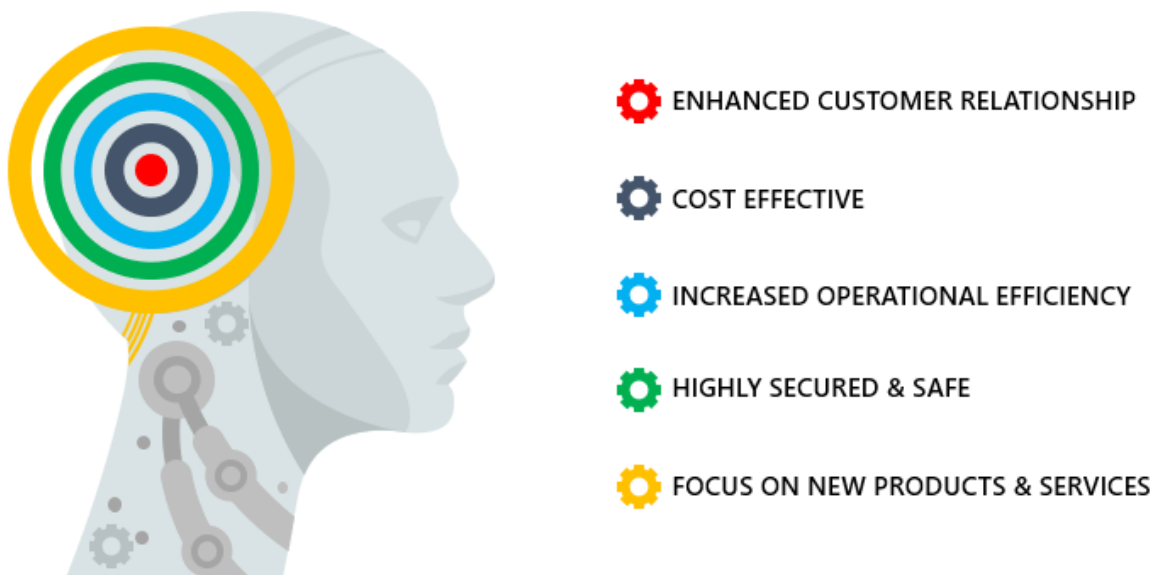
Figure 3: Advantage of combining AI with IoT

In the following paper, we will explain five concrete benefits of AI and IoT that will revolutionize the way that organizations function and identify customers (in figure 3).