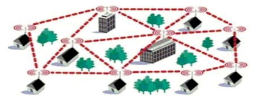
Figure 4- Distribution system

Distribution system is the term used to describe the portion of the Smart Grid that relates to the utility distribution system, specifically the wires, switches, and transformers that link the utility substation to you, the consumer.