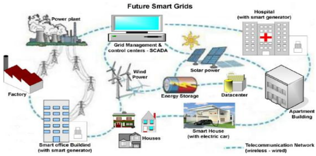
Figure 3- Future Smart Grid

To encourage innovation in the smart grid technology sector, the Department of Energy proposed spending $3.5 billion between 2016 and 2026. Machine learning, plug-and-play technologies, a self-healing grid, and complete grid automation will be the main areas of research.